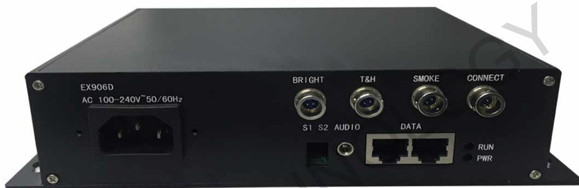
Fig 1 Interface on front side