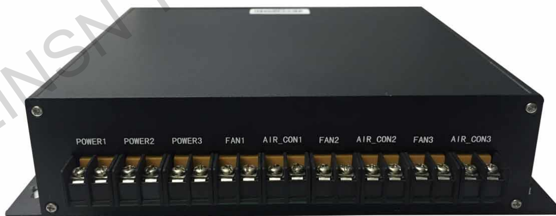
Fig 2 Interface on backside